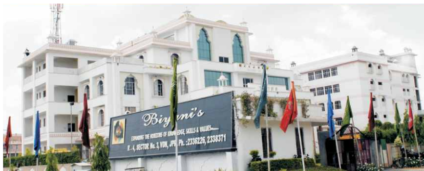
Biyani Girls College, Jaipur